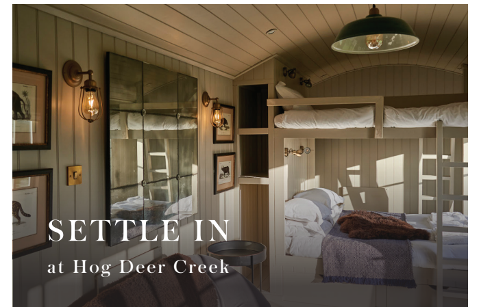
SETTLE IN at Hog Deer Creek