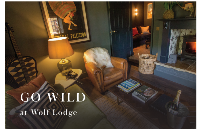
GO WILD at Wolf Lodge