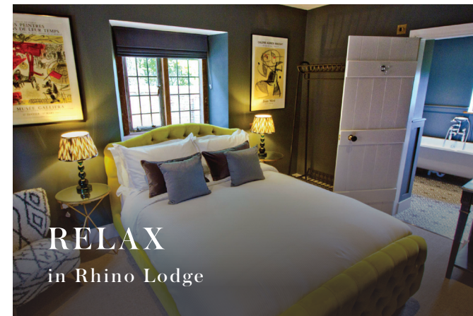
RELAX in Rhino Lodge