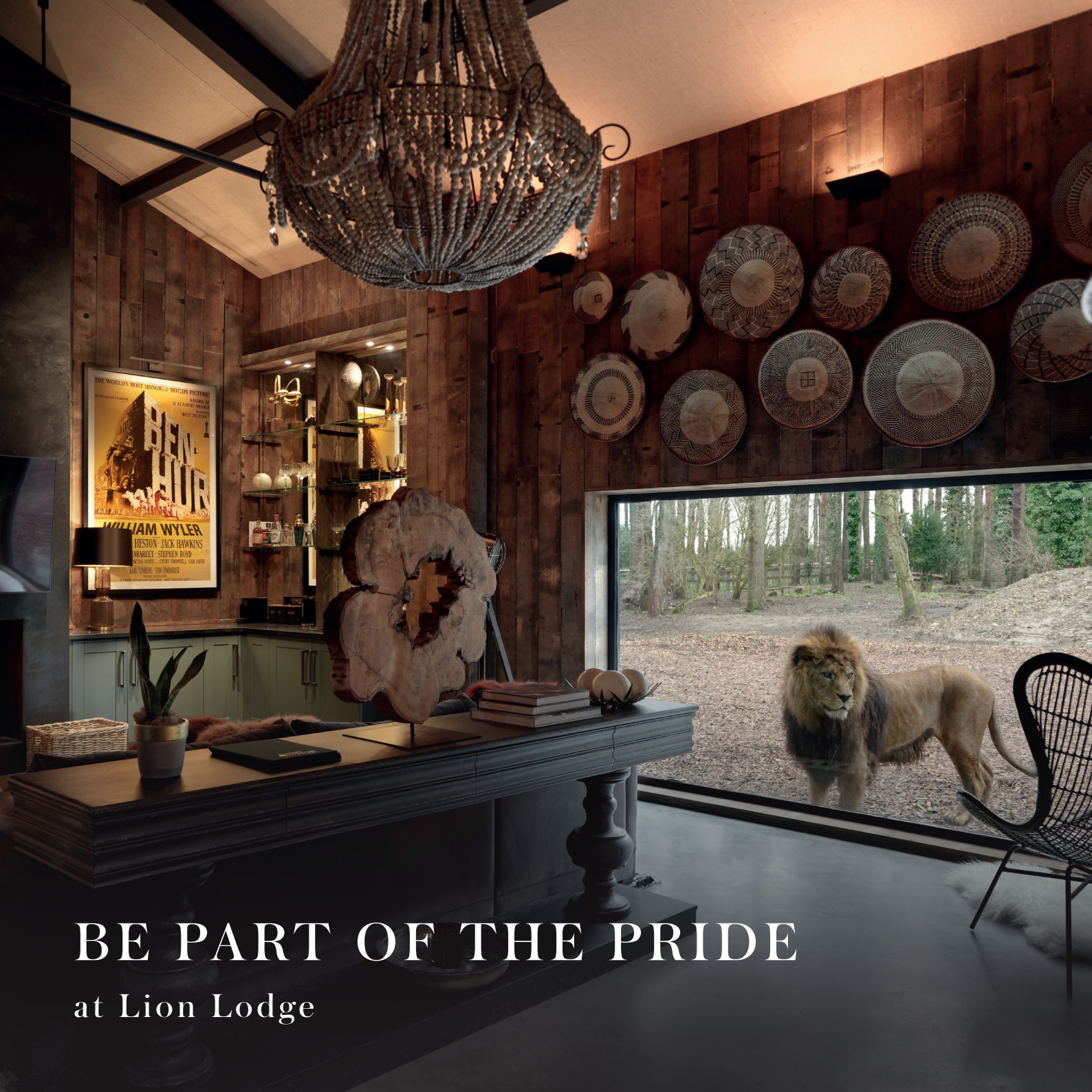
BE PART OF THE PRIDE at Lion Lodge