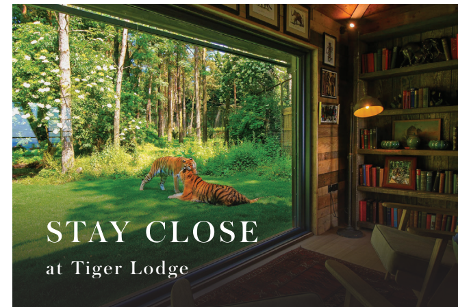
STAY CLOSE at Tiger Lodge