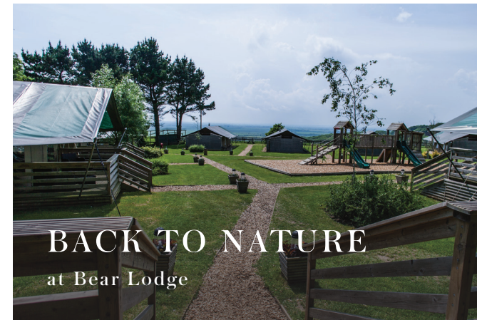
BACK TO NATURE at Bear Lodge