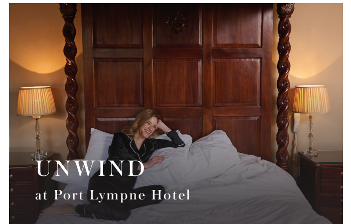
UNWIND at Port Lympe Hotel