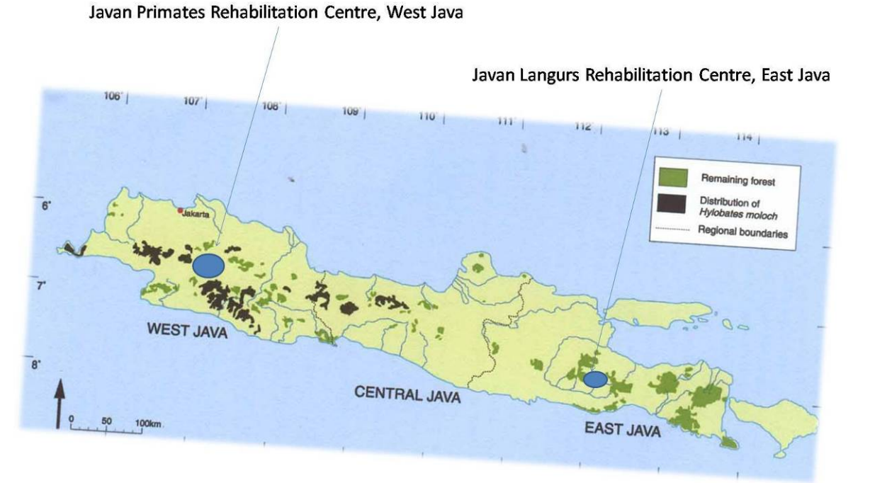
Figure 2. Map of Java with location of the two primate rehabilitation centres managed by The Aspinall Foundation Indonesia.