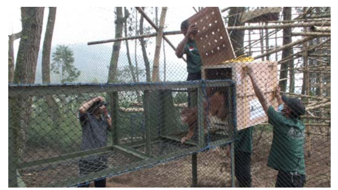
Figure 7. The Javan langurs from UK arriving at their quarantine facility at the JPRC in Bandung, West Java, February 2013.