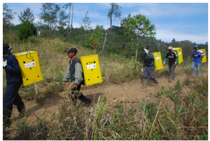
Figure 10. The transport of 13 Javan langurs from the JLRC to the release site one week prior to release, September 2012.