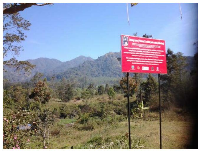
Figure 4. The JLRC (pre-release site) in the foreground and the Coban Talun Protected Forest, including the peak of the Gunung Pusungrawung release site, in the background.

Conservation, Directorate General Forest Protection and Nature Conservation, Ministry of Forestry of the Republic of Indonesia, and the State Owned Forestry Enterprise (Perum Perhutani), Ministry of Enterprise, Republic of Indonesia.