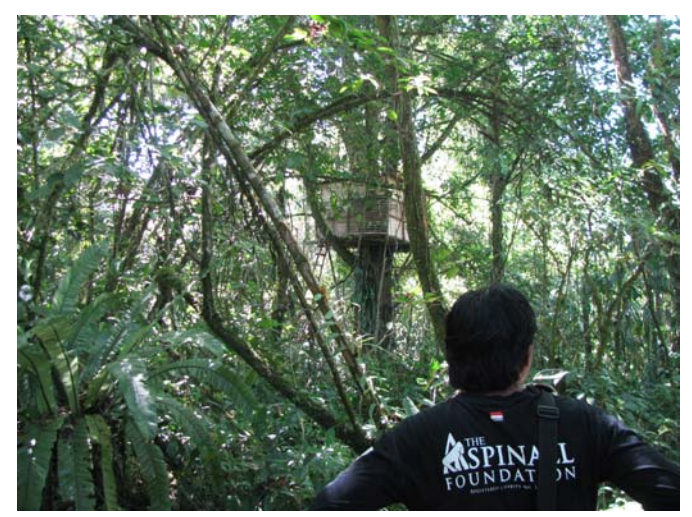
Figure 11. The cage at the final release site used as part of a soft-release process for the first group of Javan langurs released in 2012.

The diet of the langurs during the pre-release phase includes food plants present at the release site. All necessary pre-release procedures, such as final veterinary exams and behavioural observations, are undertaken during the pre-release phase at the JLRC.