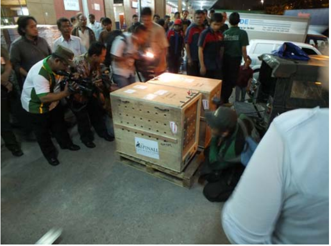
Figure 5. The first group of Javan langurs arriving from UK at Jakarta International Airport, Java, February 2013.