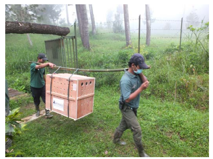
Figure 6. The Javan langurs from UK arriving at the JPRC in Bandung, West Java, February 2013.