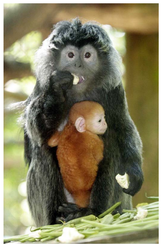
Figure 1. Javan langurs are all born with orange fur, but most turn black at a few weeks of age.

The Javan langur Trachypithecus auratus (Primates: Cercopithecidae) is endemic to Indonesia and is currently considered as Vulnerable by the IUCN (Nijman & Supriatna 2008, IUCN 2012). It is also known as "Javan Lutung" or "Ebony Leaf Monkey" (IUCN 2012), and local names include "Lutung" and