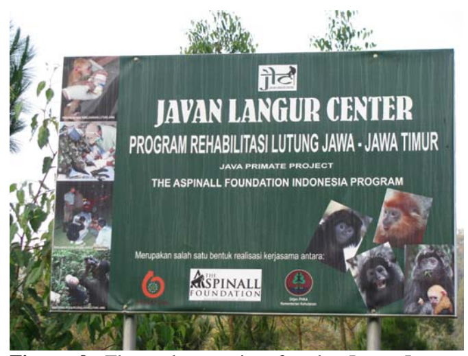
Figure 9. The welcome sign for the Javan Langur Rehabilitation Centre (JLRC), East Java.