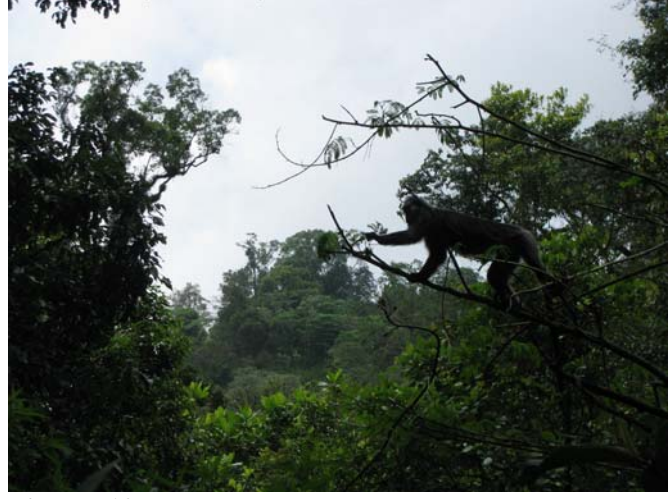
Figure 12. One of the first released group of Javan langurs in Gunung Pusungrawung in March 2013, six months post-release.

hunting, and loss of habitat. Populations of the subspecies occurring in East Java, Trachypithecus auratus auratus, occur in isolated forest fragments, and in many of these appear to be at low densities or in some cases extinct. The Gunung Pusungrawung forest block within the Coban Talun Protected Forest in East Java is one example of a forest fragment where the Javan langur appears to have been hunted virtually to extinction. The project to reinforce the currently very langur small Javan population in Gunung Pusungrawung will not only result in the reestablishment of a viable population at this site, but will also have secondary conservation benefits including increasing the protection of the forest and the Raden Soerjo Forest Park within which it is located, increasing the potential to conserve the species through finding solutions to the illegal pet trade, increasing public awareness of primate conservation issues in Java, and providing opportunities to national students to study issues relative to primate conservation as part of their University training.