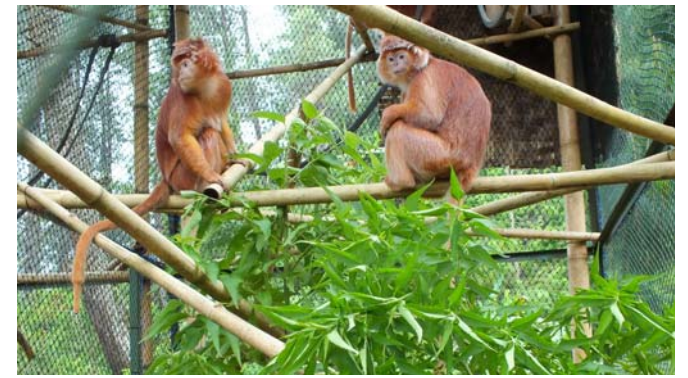
Figure 8. The Javan langurs from UK settling in to their quarantine facility at the JPRC in Bandung, West Java, February 2013.