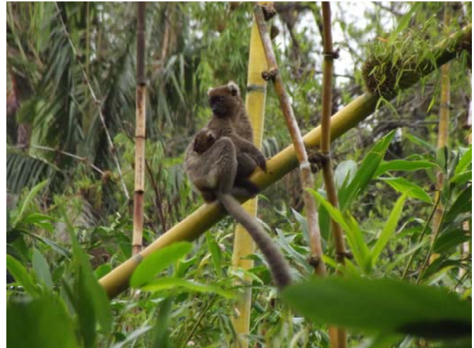
Figure 7. A greater bamboo lemur and baby at the isolated lowland site of Vohiposa, March 2012.