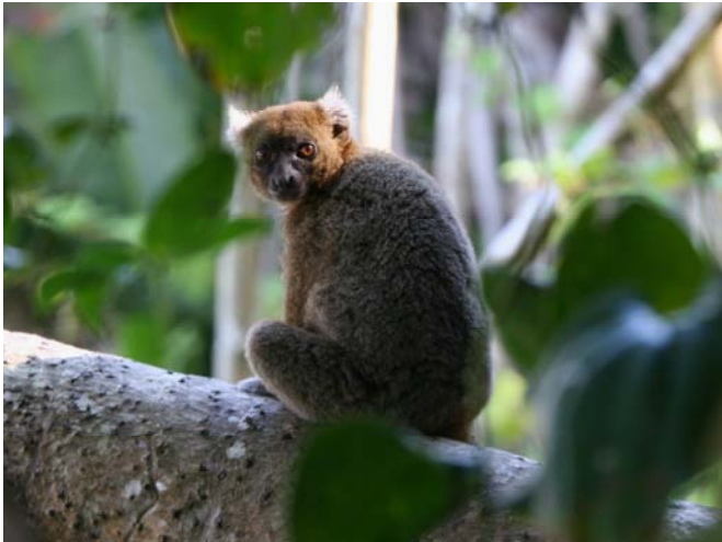
Figure 6. A greater bamboo lemur at the isolated lowland site of Sahavola, December 2011.